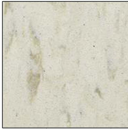
51899 COOL WHITE