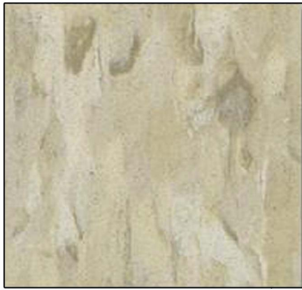
51839 FORTRESS WHITE

OFFICE: (912)632-3344 - FAX: (912)632-3345