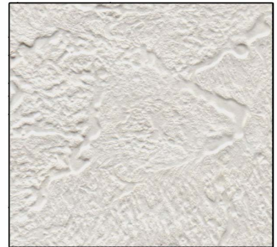
RUFF STUFF WHITE

*On-screen and printed colors could vary slightly due to monitor and printer calibrations.