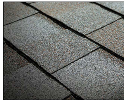
OLD ENGLISH PEWTER